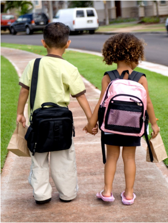
Use the Buddy System when walking home from school!